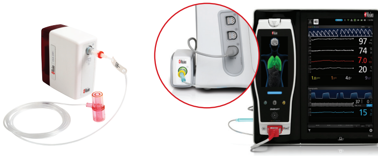
The NomoLine Airway Adapter Set connects to the ISA module

Root capabilities expand with the ISA™ family of modules to include real-time capnography and gas measurements