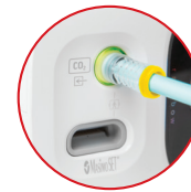
Light Emitting Gas Inlet (LEGI) indicator changes color to indicate if the NomoLine sampling line is correctly connected or occluded